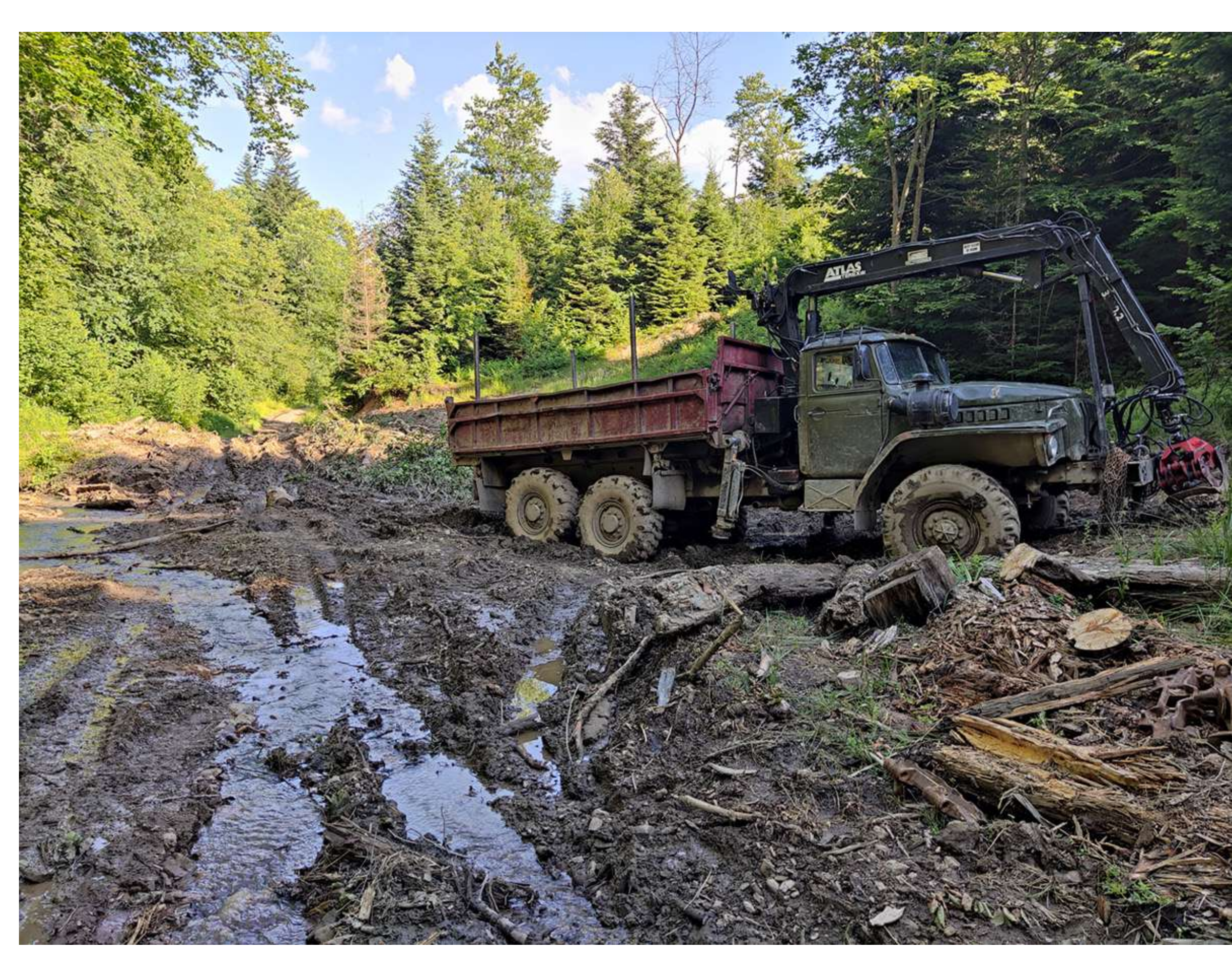
Logging machinery destroys a stream in the Carpathian mountains

https://forest.gov.ua/regulyatorna-diyalnist/proekti-regulyatornih-aktiv/23032023-povidomlennia-pro-opryliudnennia-proiektu-posta novy-kabinetu-ministriv-ukrainy-deiaki-pytannia-zdiisnennia-rubok-v-lisakh-ukrainy