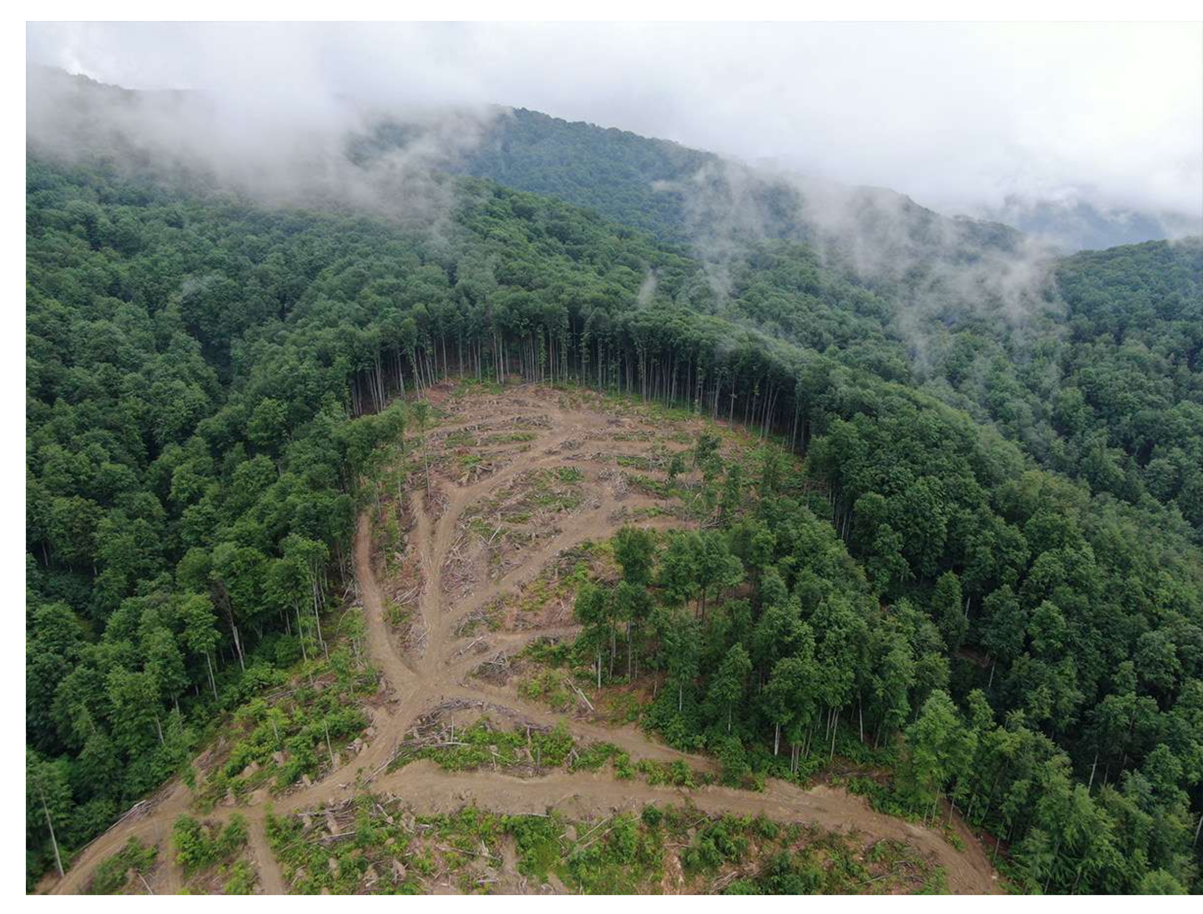
Sanitary clearcut in the Carpathians