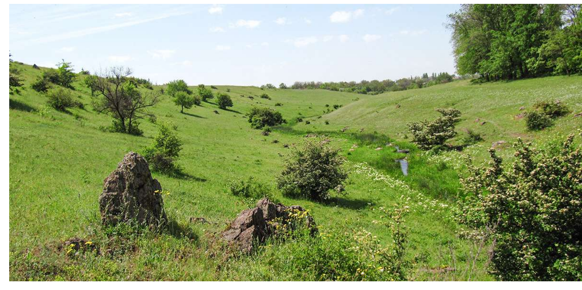
Steppe in Dnipropetrovsk region

The destruction of grasslands (as well as self-sown forests) was facilitated by the land reform that lasted until 2021. It resulted in the transfer of state agricultural and reserve lands to communities. As a rule, these were also the remnants of Ukrainian grasslands.