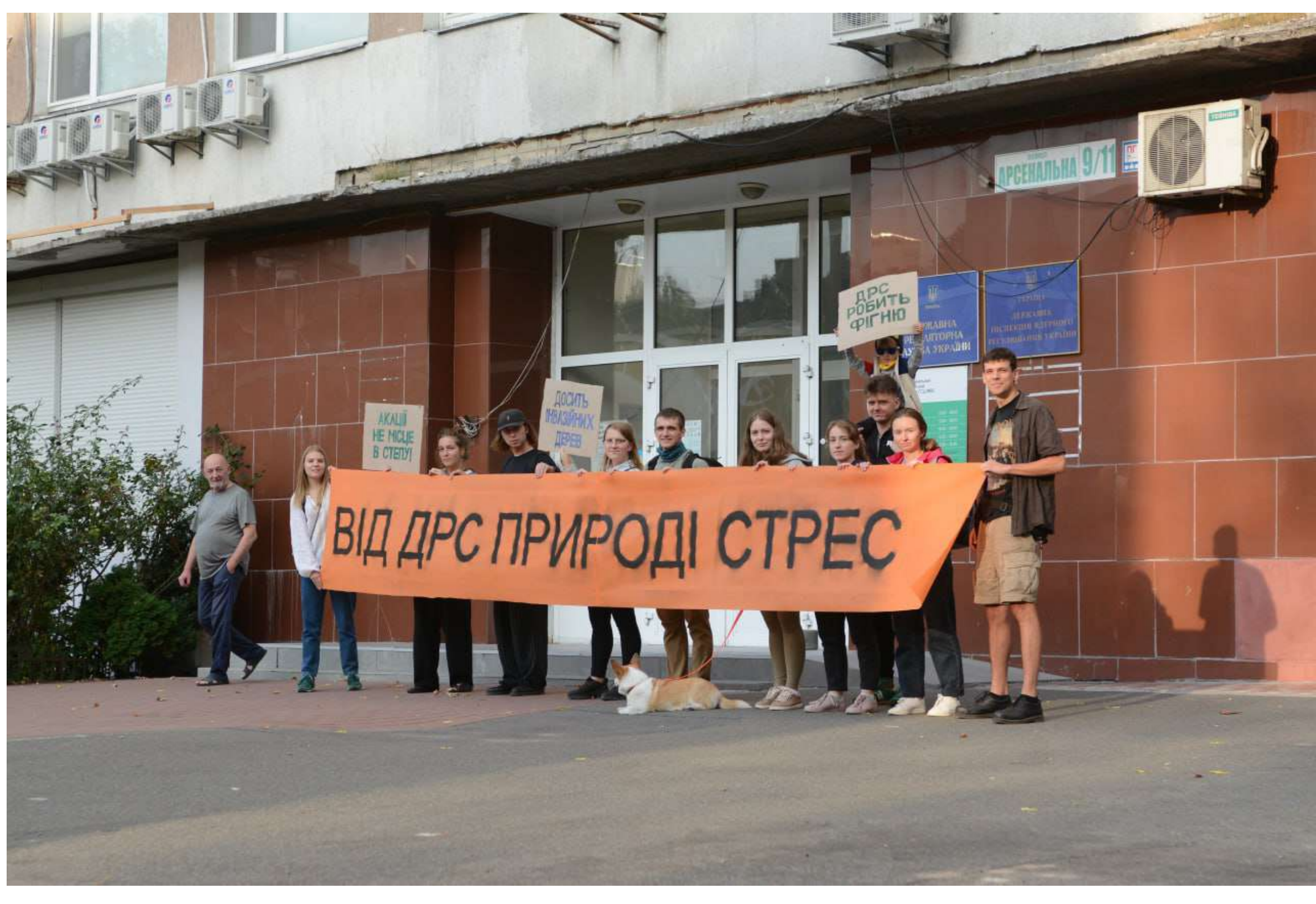
Environmental activists support the ban on the use of invasive tree species in forestry

Another significant problem is the general decline in the attention of Ukrainian society to environmental issues, which is quite expected. In such conditions, it is more difficult for activists to create the public outcry necessary to eliminate threats to wildlife.