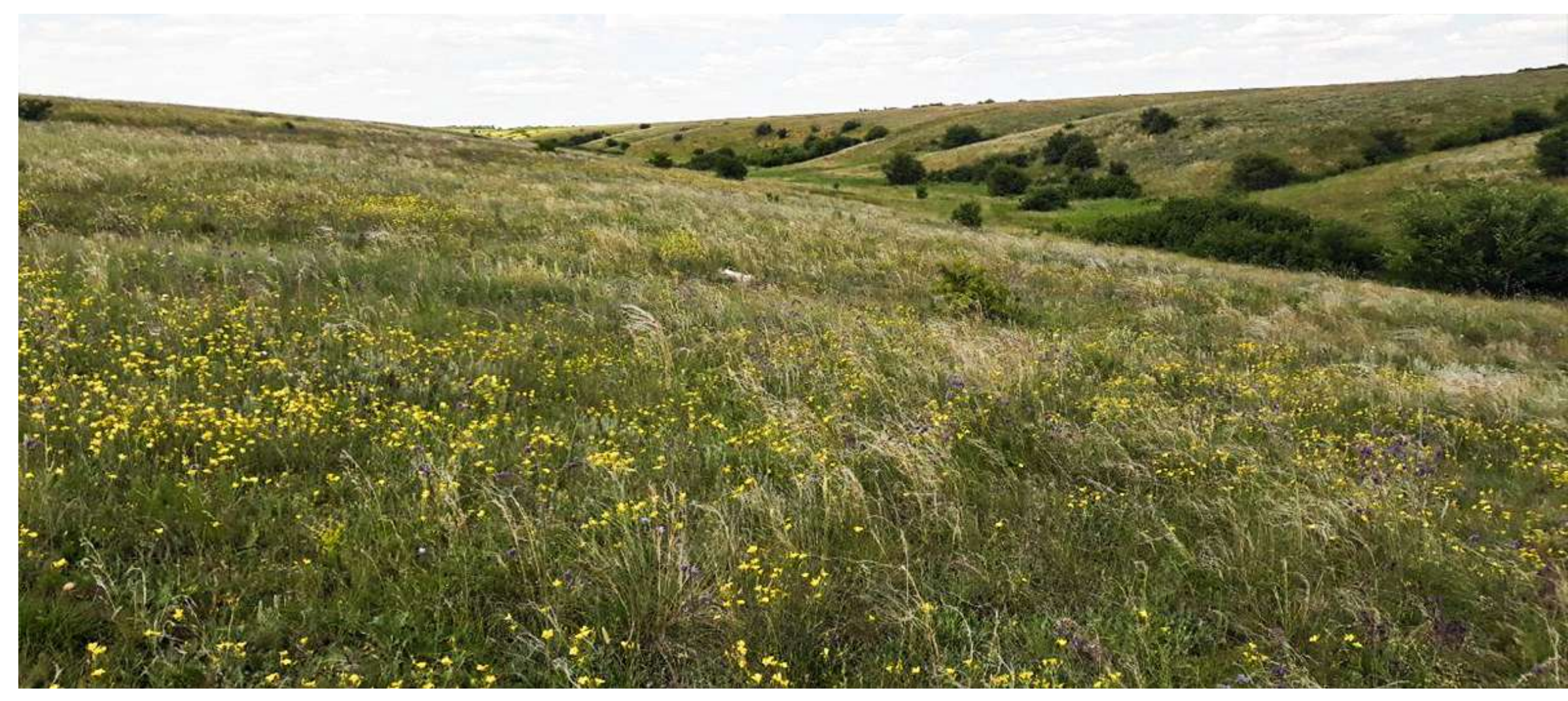
Steppe in Mykolaiv region

Land managers also often ignore the existence of restrictions on plowing land, such as riparian protection strips, and such restrictions as steep slopes or small river floodplains are not listed in the list of restrictions on use. Therefore, even the introduction of legislative restrictions on plowing up grasslands does not prevent it from being plowed up, and government agencies (including the State Cadastre Service) are not working to solve this problem<sup>31</sup>.