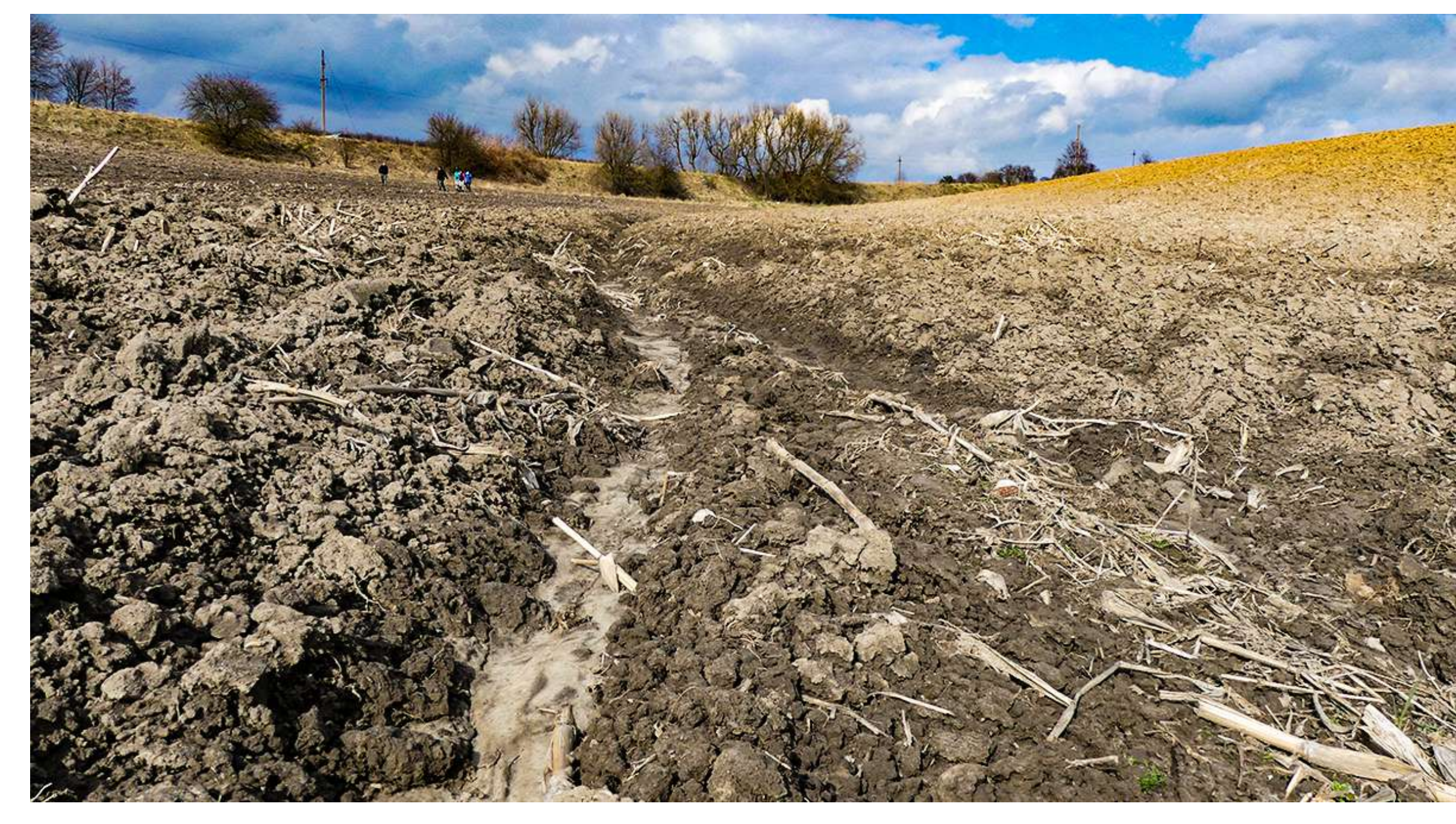
Erosion due to plowing of slopes in Lviv region