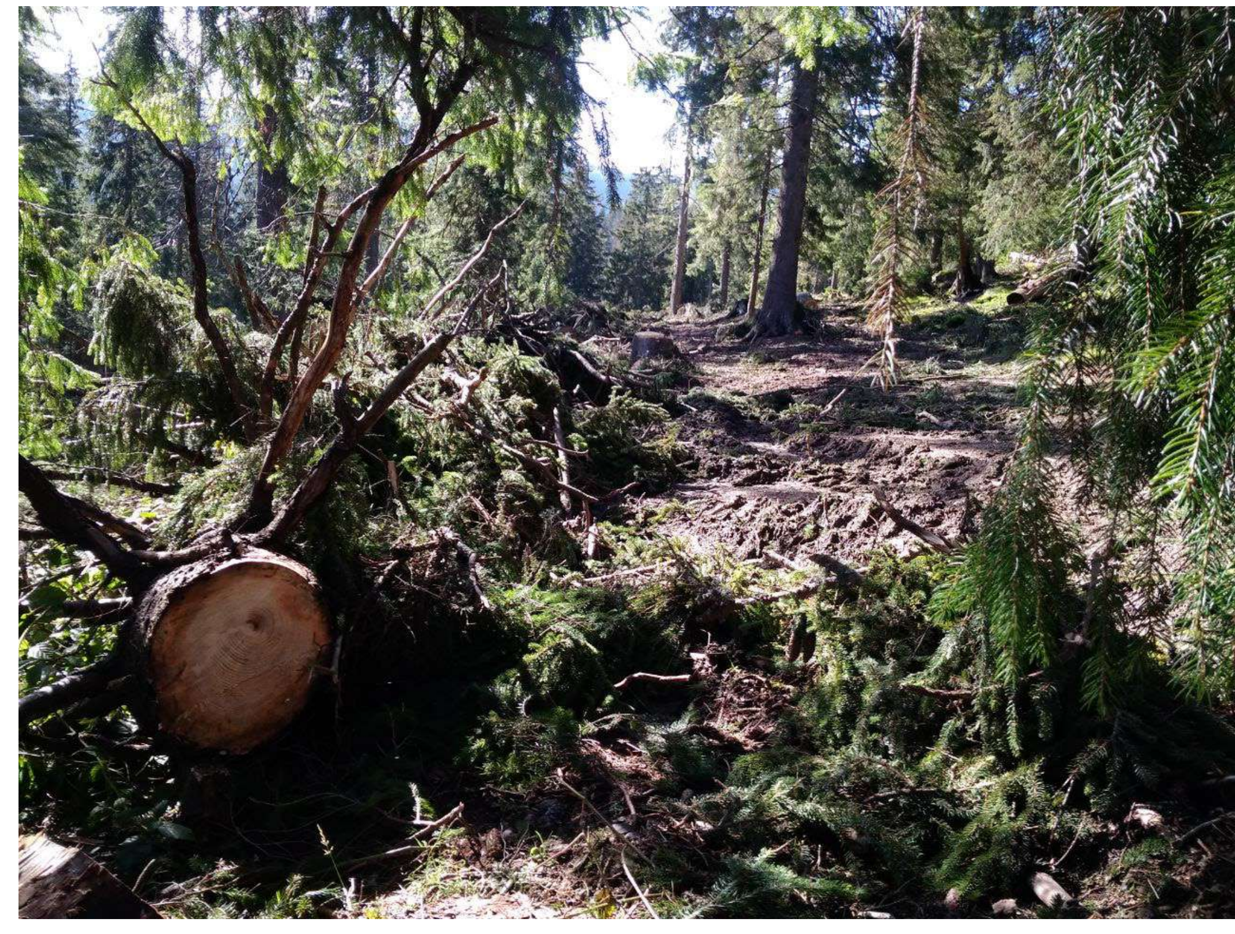
Illegal logging of a virgin forest in the Carpathian Mountains

On the other hand, the possibility of implementing full-scale biodiversity monitoring in the context of war and post-war reconstruction seems unlikely. First and foremost, the lack of funds in the state budget (especially for activities that are so obscure to many officials) and the lack of qualified personnel due to the departure of many scientists and managers abroad will be a factor. The quality of biodiversity monitoring may also be affected by the procedure for its implementation, which is currently being developed by the Cabinet of Ministers.